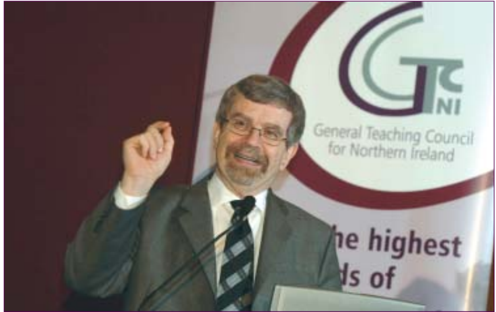
Professor Geoff Whitty.

In responding to the many pressures which face the profession Professor Whitty advocated that Teaching Councils should articulate and promote a new professional narrative based around a democratic professionalism that encourages the development of collaborative cultures both within the profession and with other educational partners. Teachers, he noted, should assume an 'activist identity'. Activist professionals take responsibility for their own on-going professional learning and work within multiple communities of practice. According to Professor Whitty, it is by exercising professional agency in a modern democratic professional community,